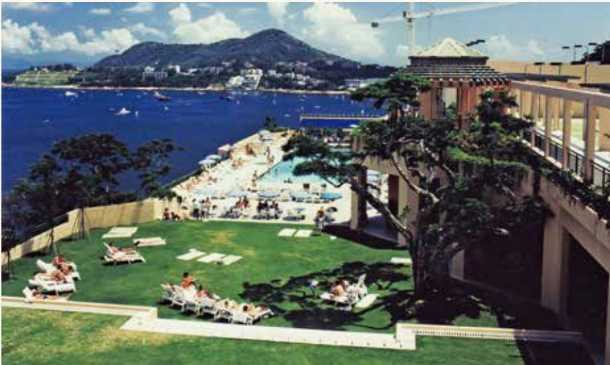
The view from the aerobics room in the Club's early days.

My best memory is standing out on the patio overlooking the lawn, and seeing all these little girls turning cartwheels on the grass. That scene represented perfectly the environment we had set out to create and I remember thinking: "We did the right thing."